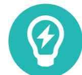
節能 Energy Saving