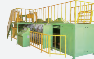
U-Turn Type Batch-Off Machine U型懸掛式膠片冷卻機