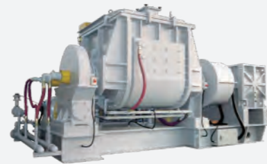
Open Kneader 非加壓式密練機