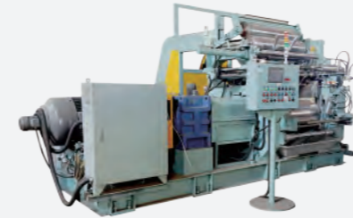
Mixing Mill/Sheeting Mill 雙滾筒混合機/出片機