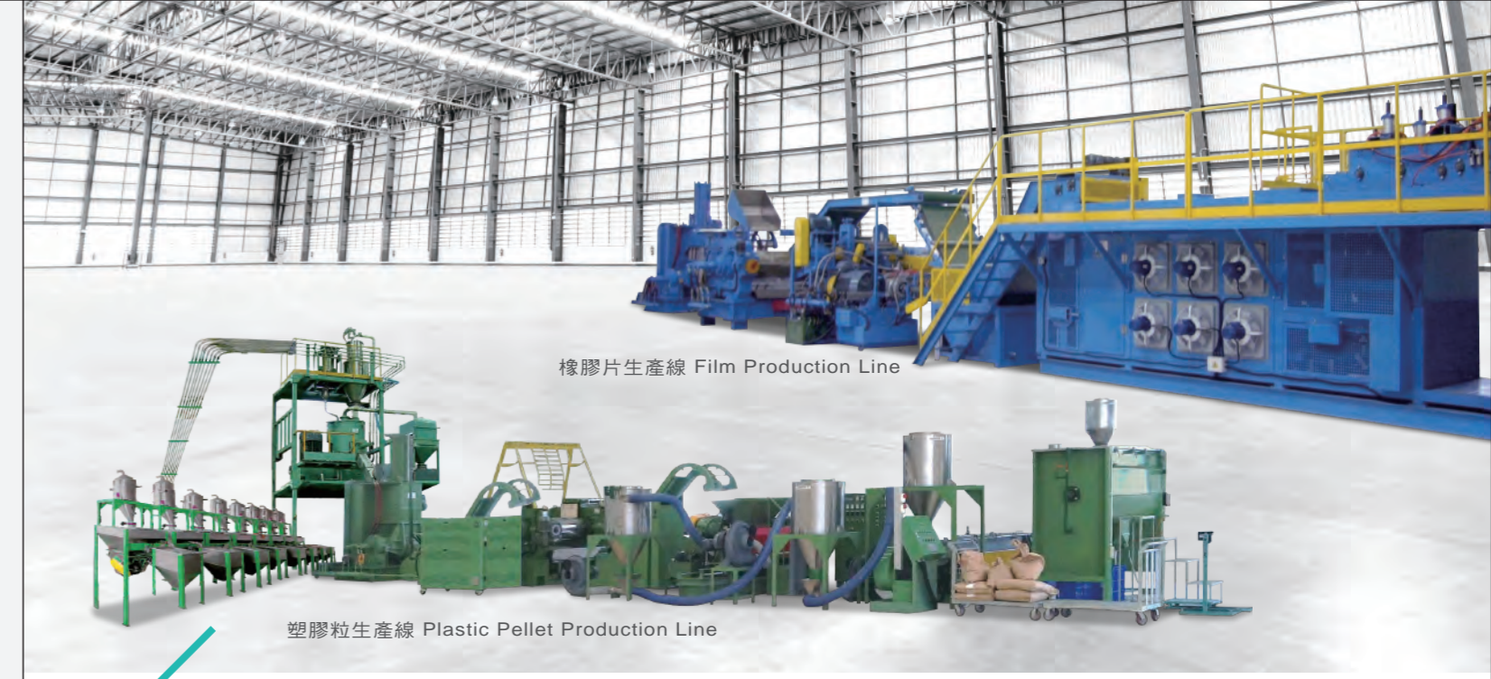
橡膠片生產線 Film Production Line