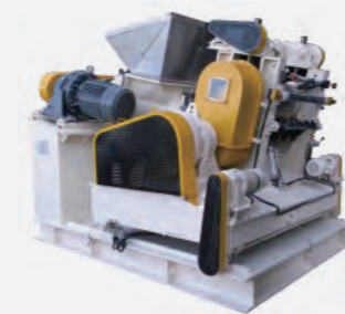
Taper Twin-Screw Sheet Pre-forming Machine SPM雙螺桿擠壓出片機