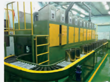
Chanical Auto Weighting Device 微量自動計量