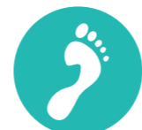
減碳 Carbon Reduction