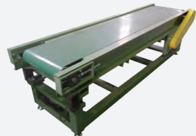
Scale Conveyor 皮帶磅秤