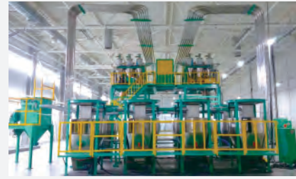
Majority Quantity Auto Weighting Device 大用量自動計量