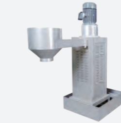
De-Water Machine 脫水機