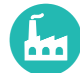
工業4.0 Industry 4.0