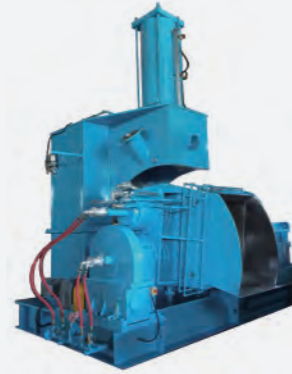
Air Ram Dispersion Kneader 空壓式密練機