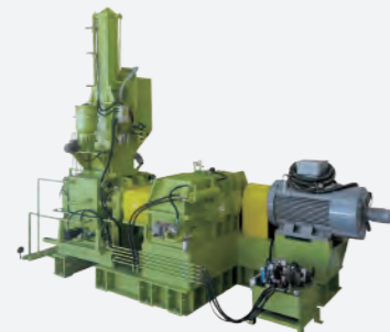
Intensive Mixer 下落式密練機 (密閉式混合機)