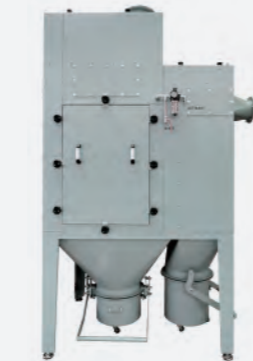
Composite Type Dust Collector 複合型集塵器