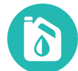
省油 Oil Saving