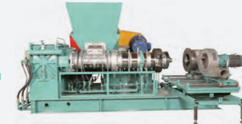
Feeder-Ruder Pellet Making FR式製粒機