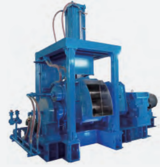
Intermesh Dispersion Kneader 咬合式密練機