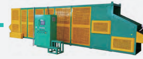
Layer Type Batch-Off Machine 平面多層式膠片冷卻機