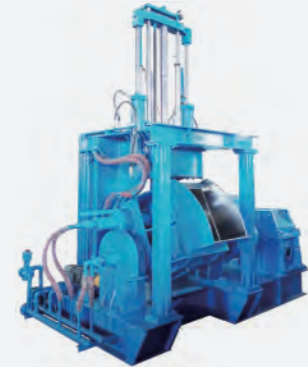
Hydraulic Ram Dispersion Kneader 油壓式密練機