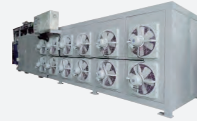
Hanger Type Batch-Off Machine 懸掛式膠片冷卻機