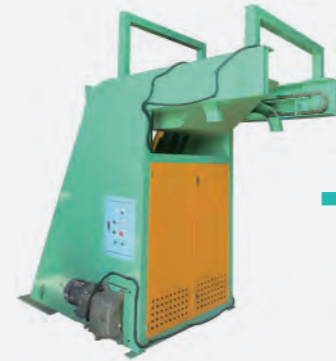
Bucket Conveyor 輸送機