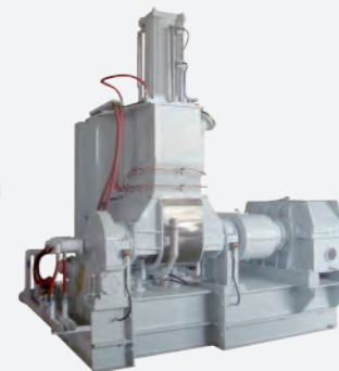
Big Rotor Dispersion Kneader 大攪拌軸密練機