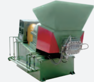
Taper Twin-Screw Sheet Extruder 2TE雙螺桿押出機