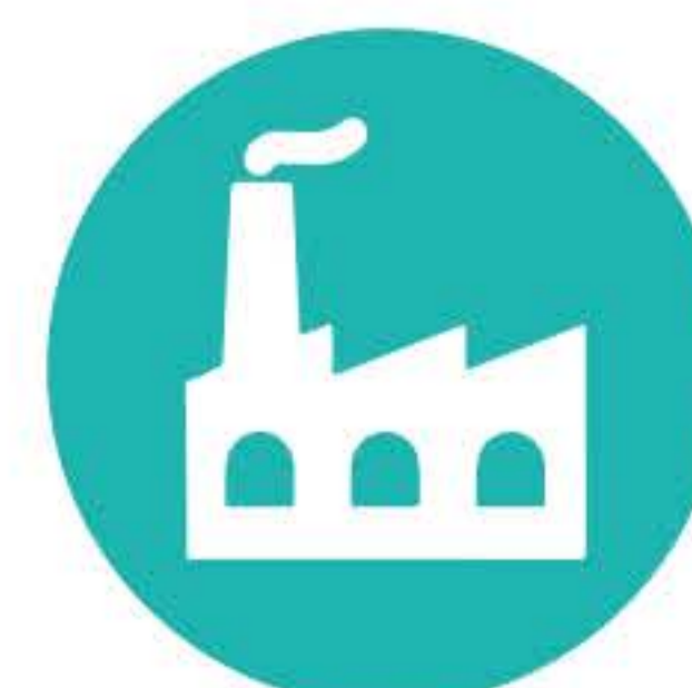
工業4.0 Industry 4.0