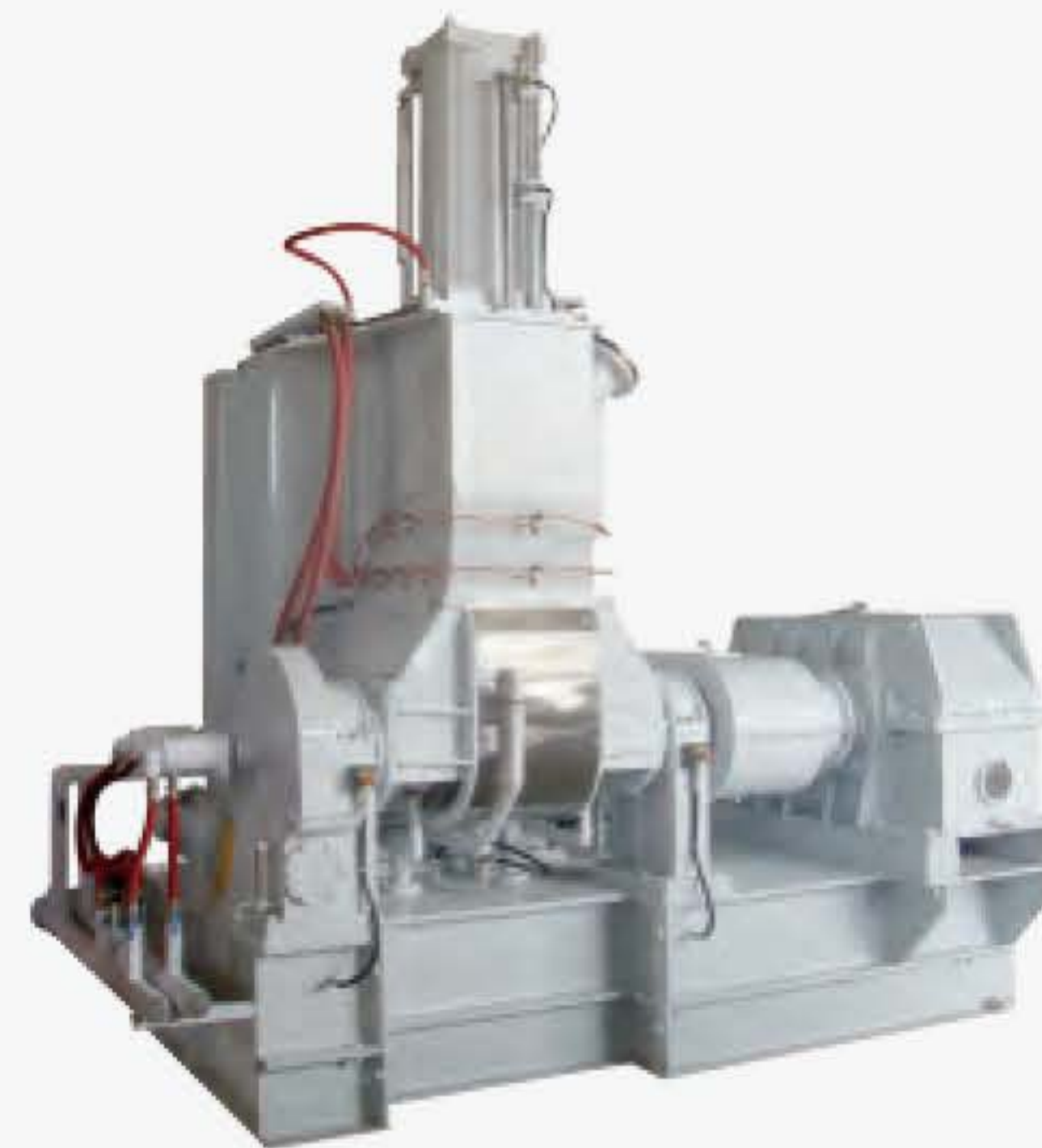
Big Rotor Dispersion Kneader 大攪拌軸密練機