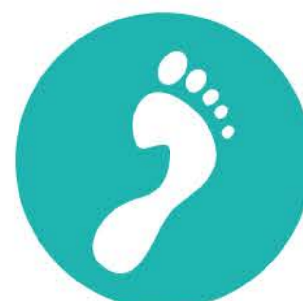
減碳 Carbon Reduction