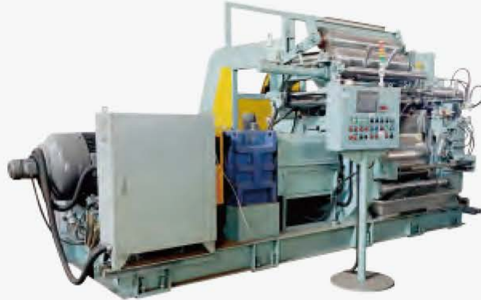
Mixing Mill/Sheeting Mill 雙滾筒混合機/出片機