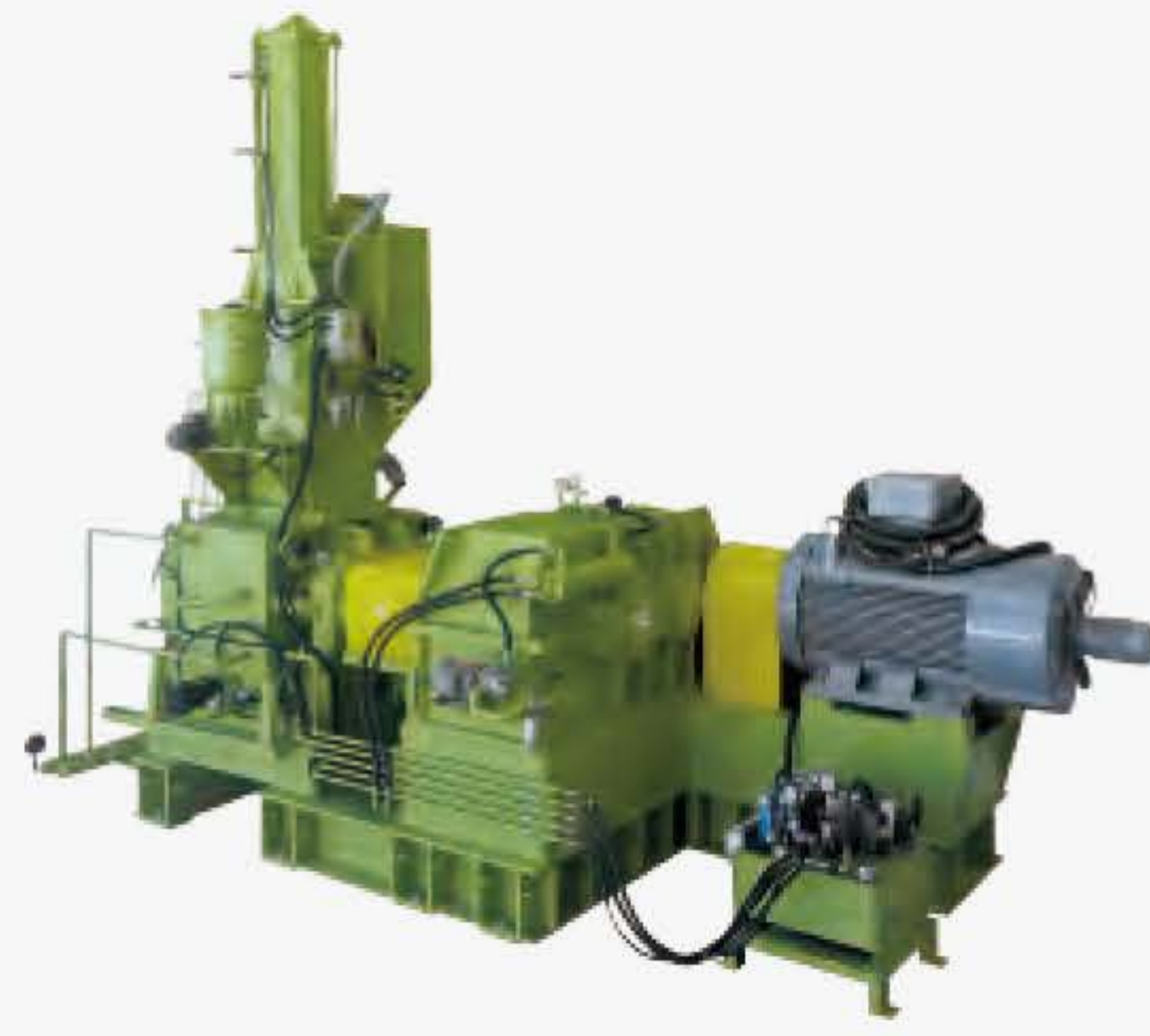
Intensive Mixer 下落式密練機 (密閉式混合機)