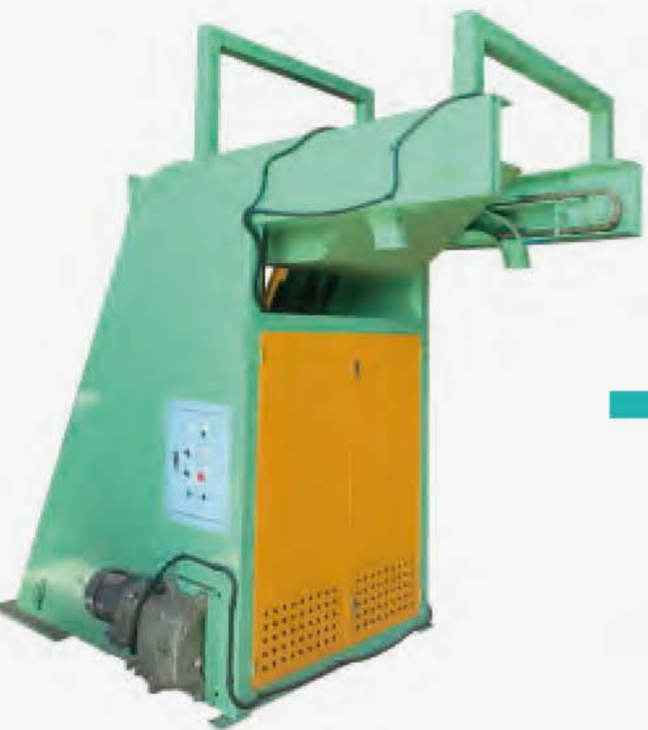
Bucket Conveyor 輸送機