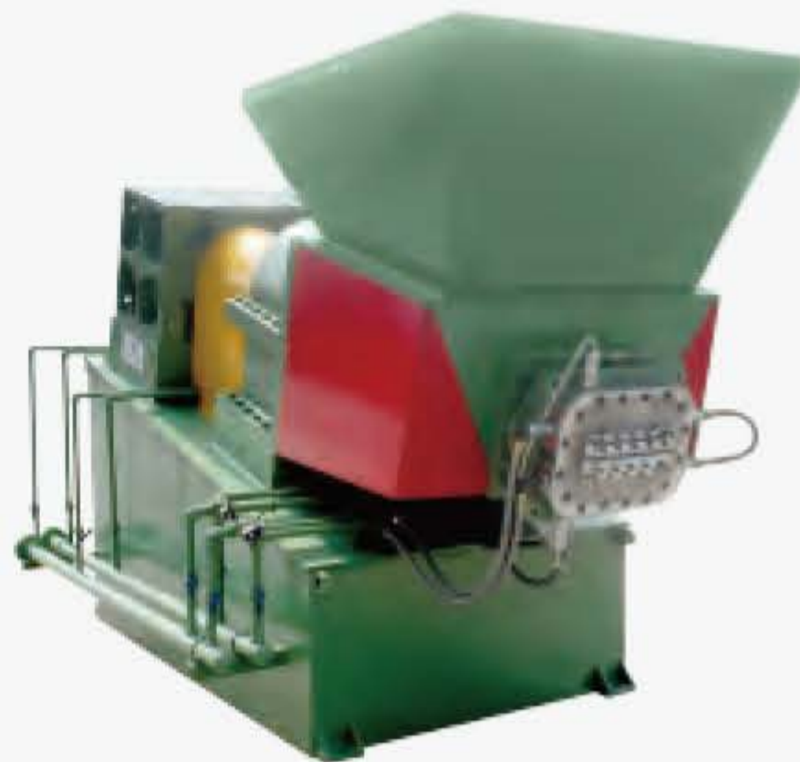
Taper Twin-Screw Sheet Extruder 2TE雙錐螺桿押出機