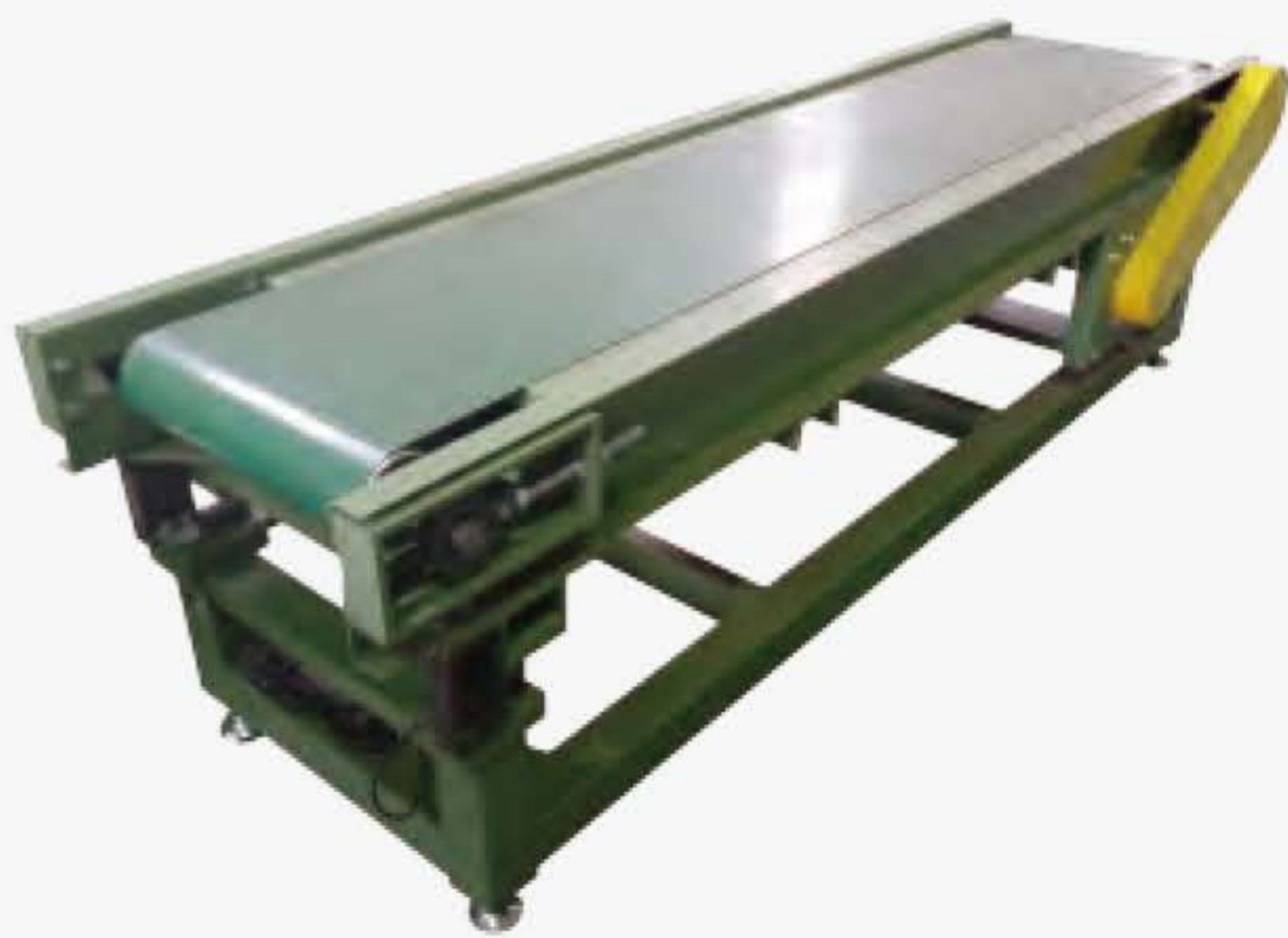
Scale Conveyor 皮帶磅秤