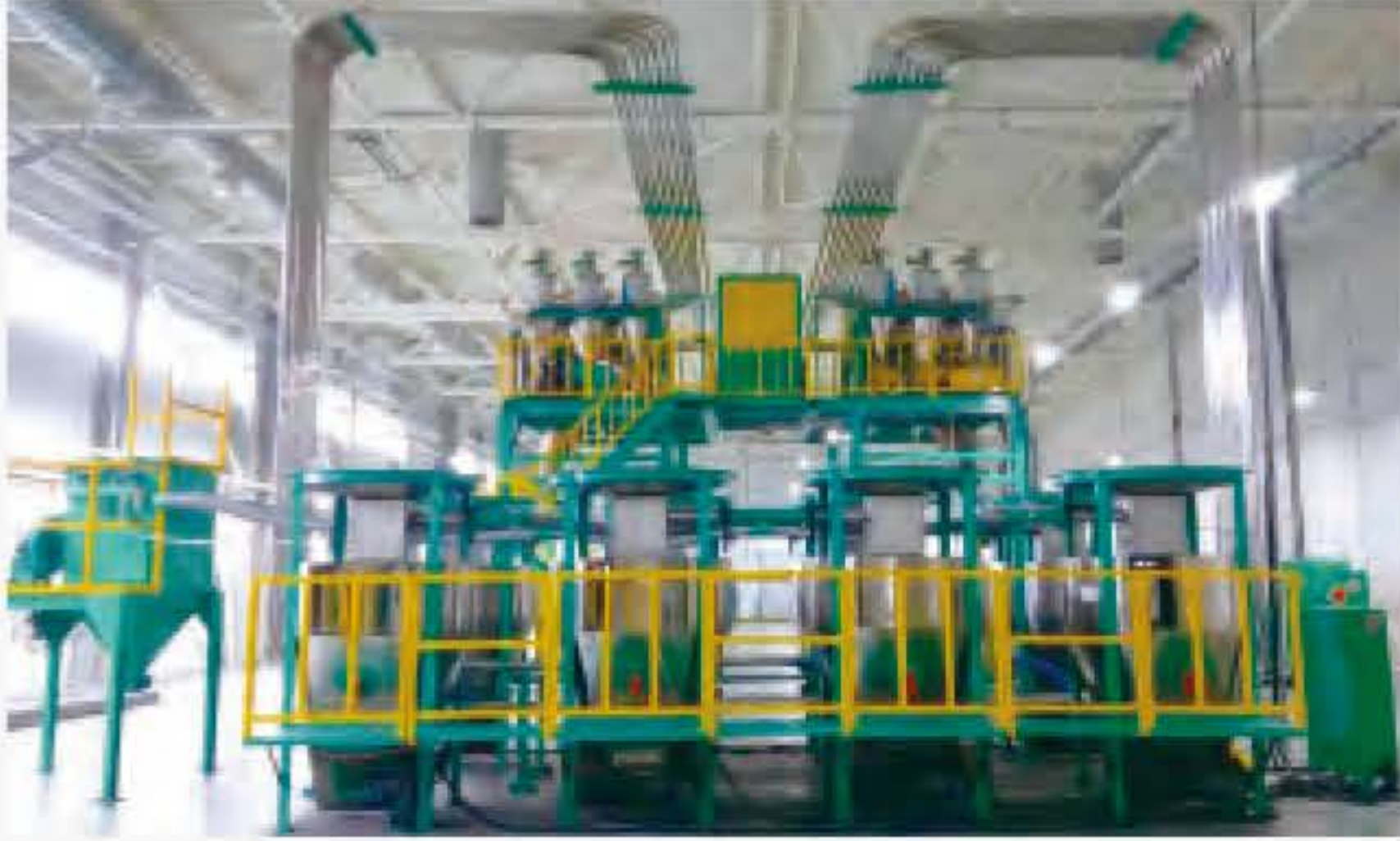
Majority Quantity Auto Weighting Device 大用量自動計量