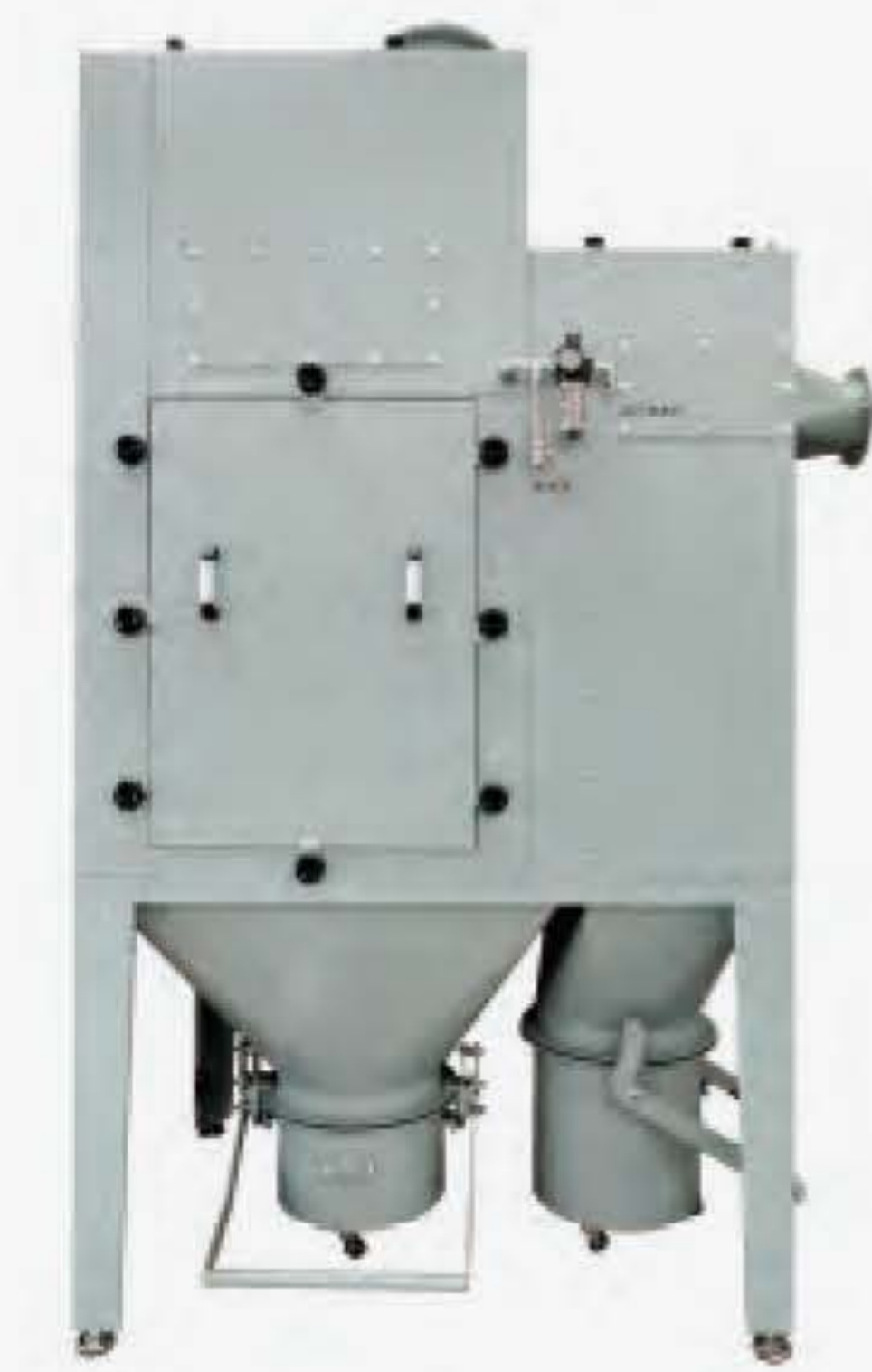
Composite Type Dust Collector 複合型集塵器