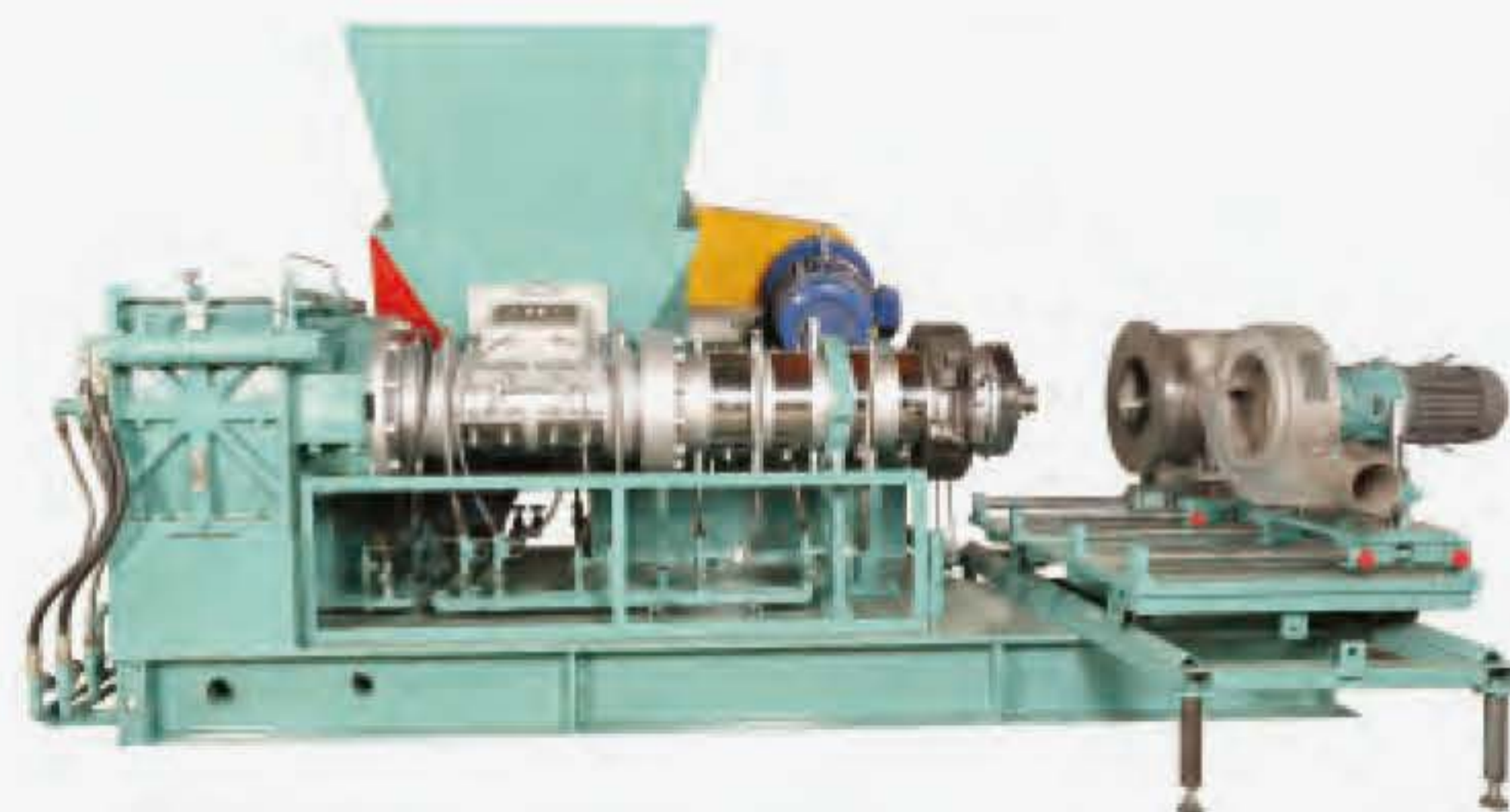
Feeder-Ruder Pellet Making FR式製粒機