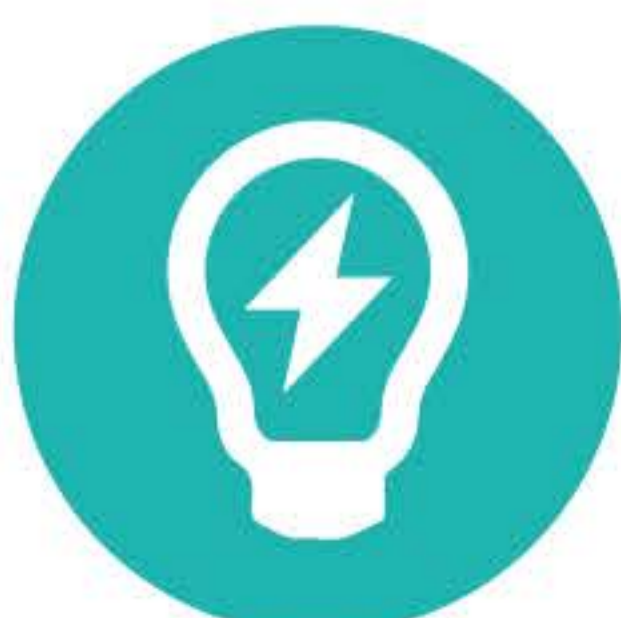
節能 Energy Saving