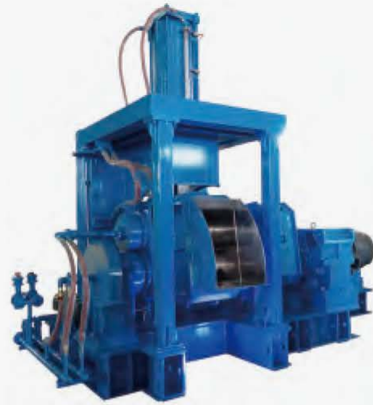
Intermesh Dispersion Kneader 咬合式密練機