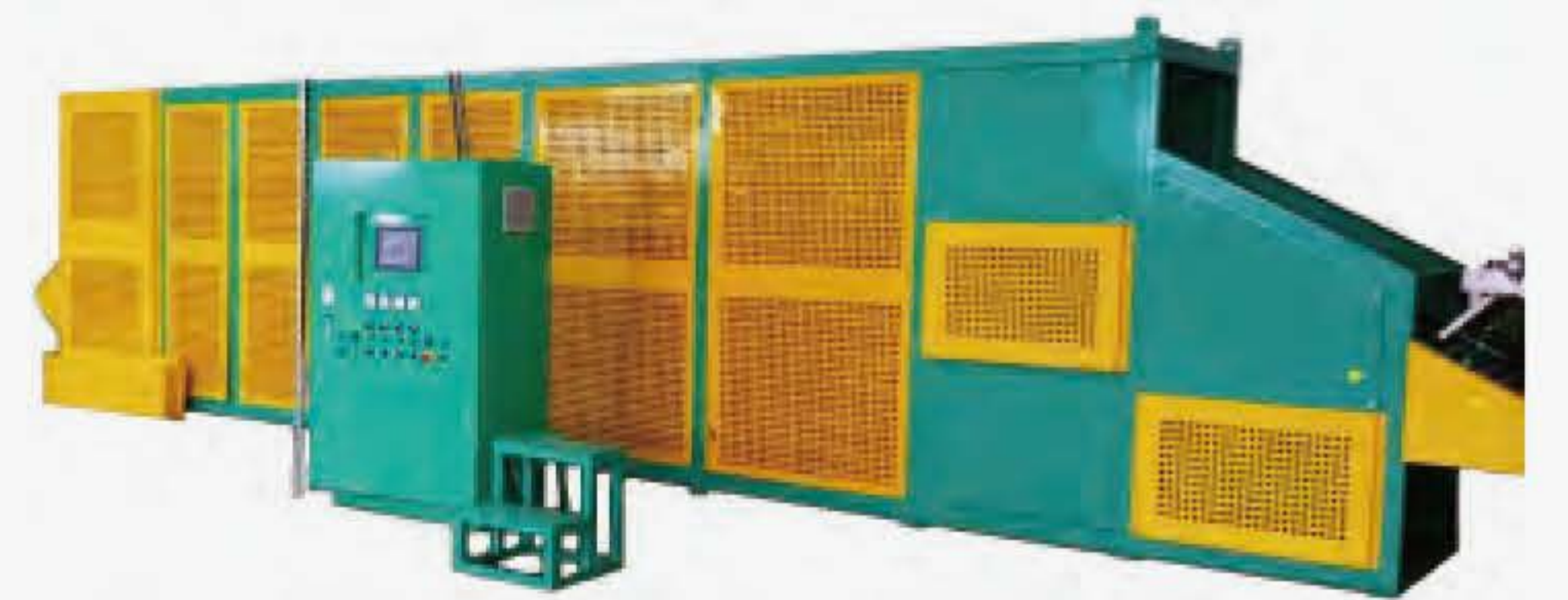
Layer Type Batch-Off Machine 平面多層式膠片冷卻機