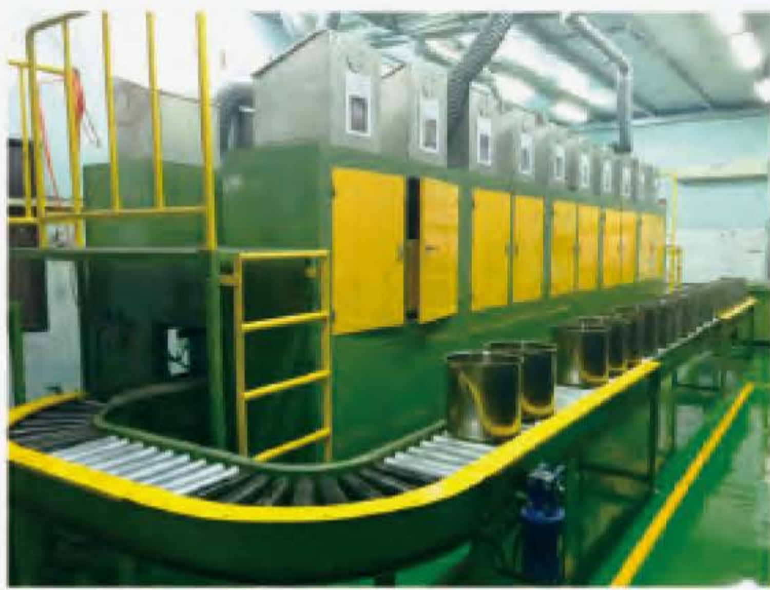
Chanical Auto Weighting Device 微量自動計量