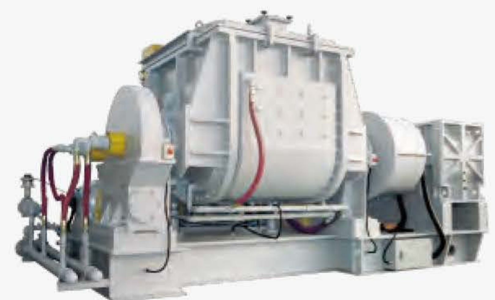
Open Kneader 非加壓式密練機