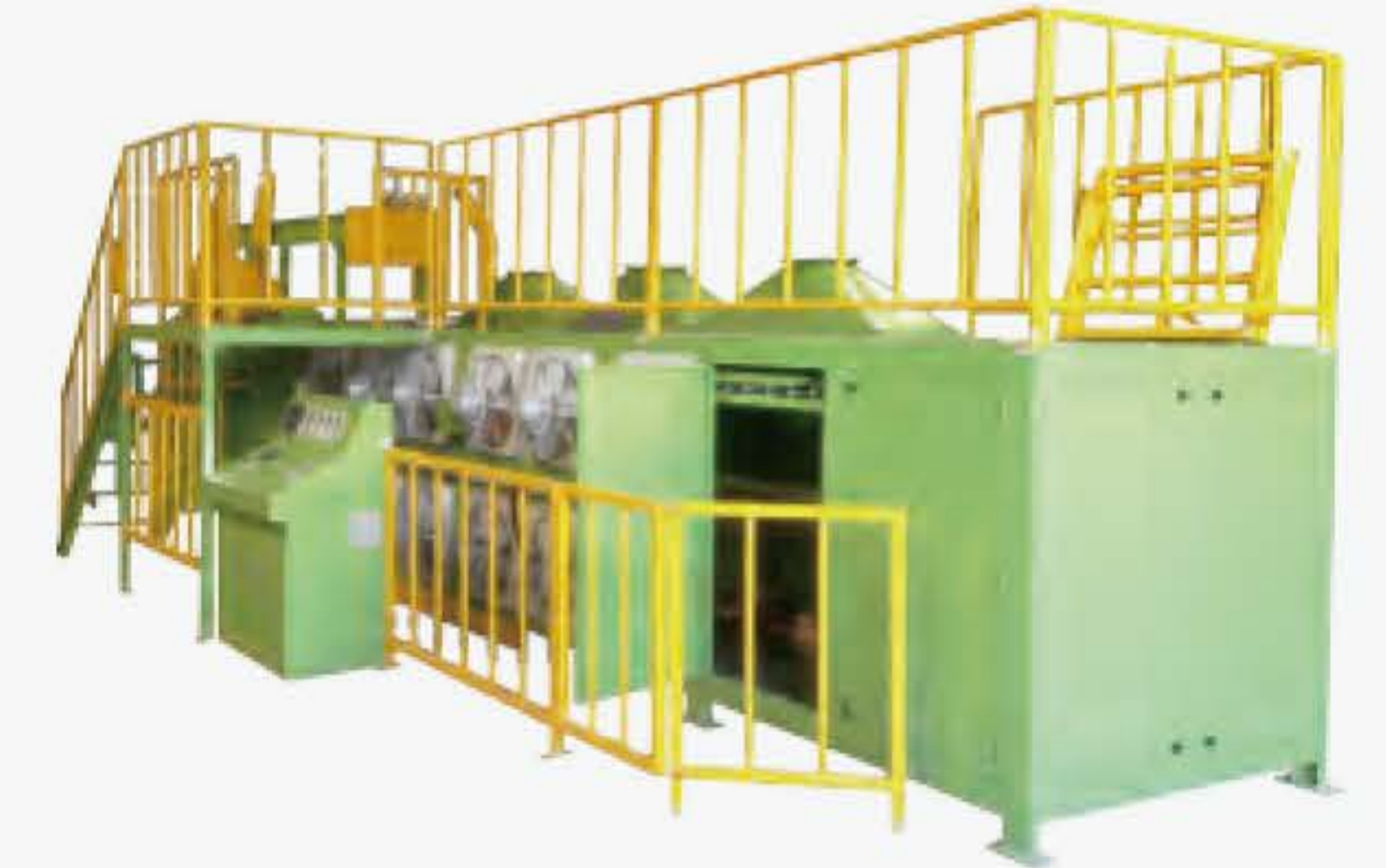
U-Turn Type Batch-Off Machine U型懸掛式膠片冷卻機