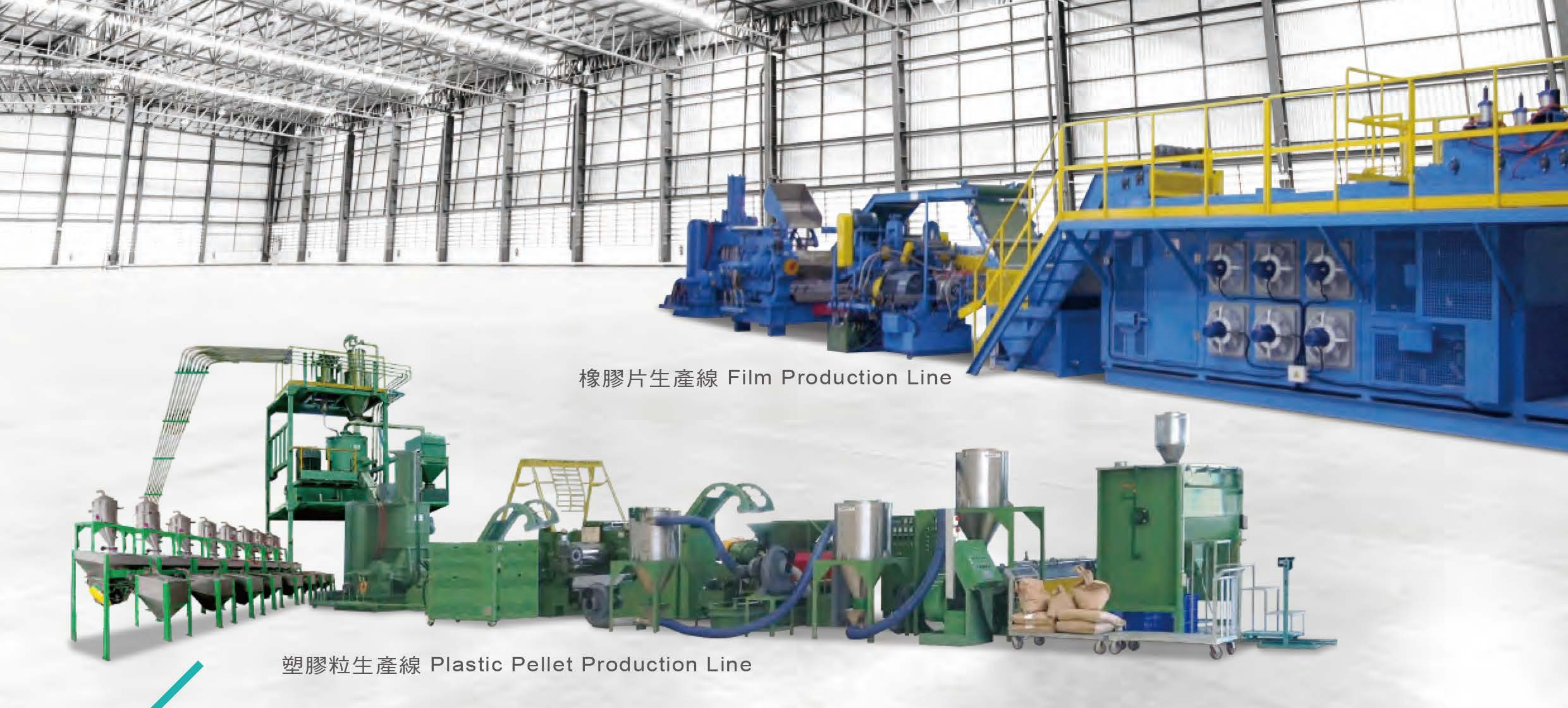
橡膠片生產線 Film Production Line