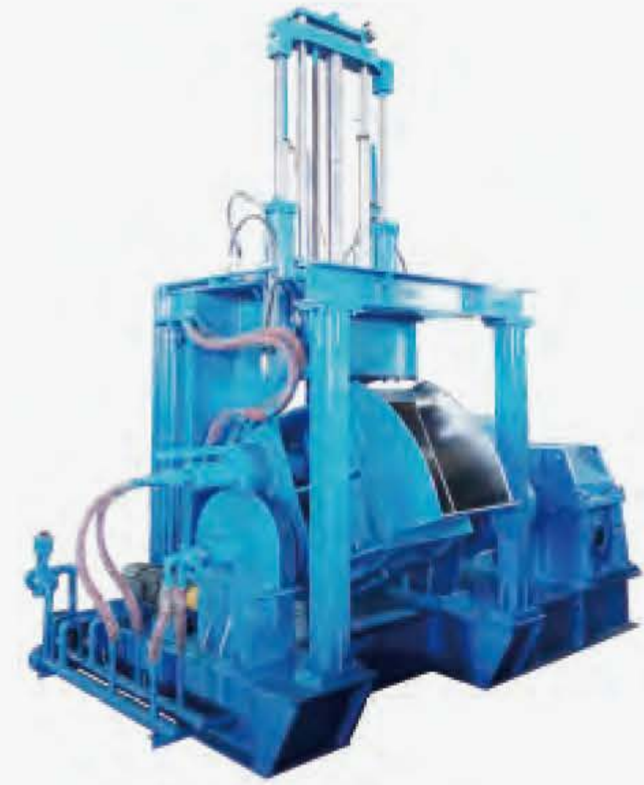
Hydraulic Ram Dispersion Kneader 油壓式密練機