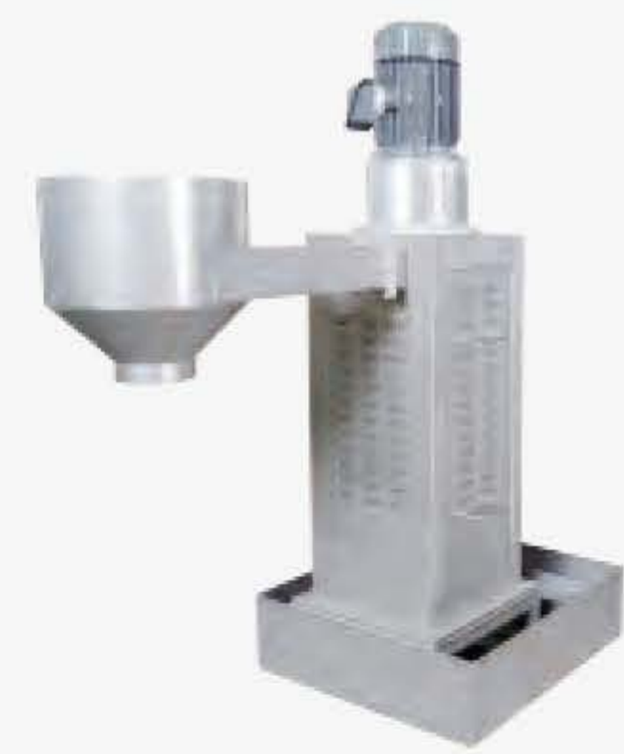
De-Water Machine 脫水機