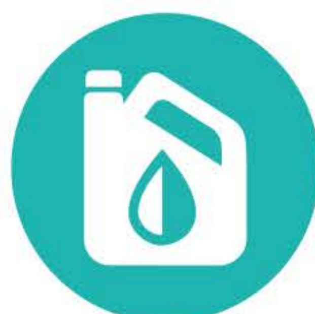
省油 Oil Saving