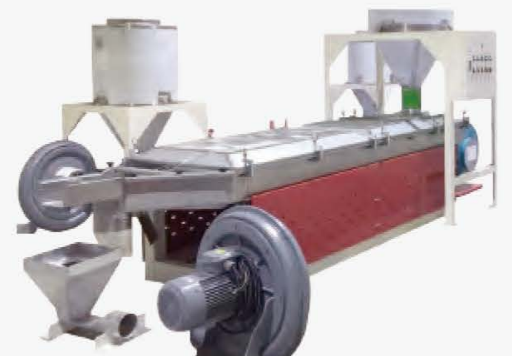
Vibration Conveyor 震動篩選機