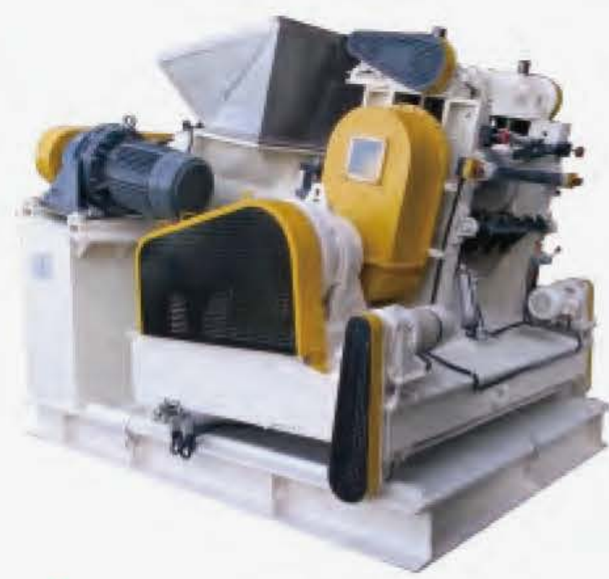
Taper Twin-Screw Sheet Pre-forming Machine SPM雙螺桿擠壓出片機