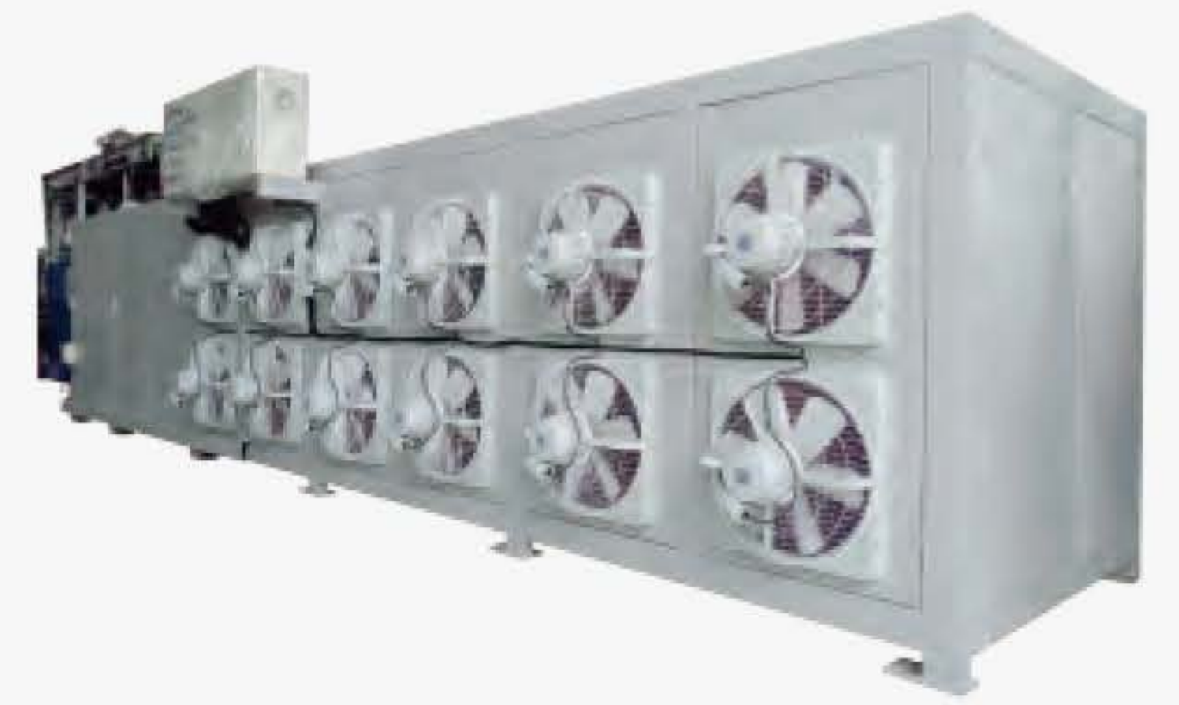
Hanger Type Batch-Off Machine 懸掛式膠片冷卻機