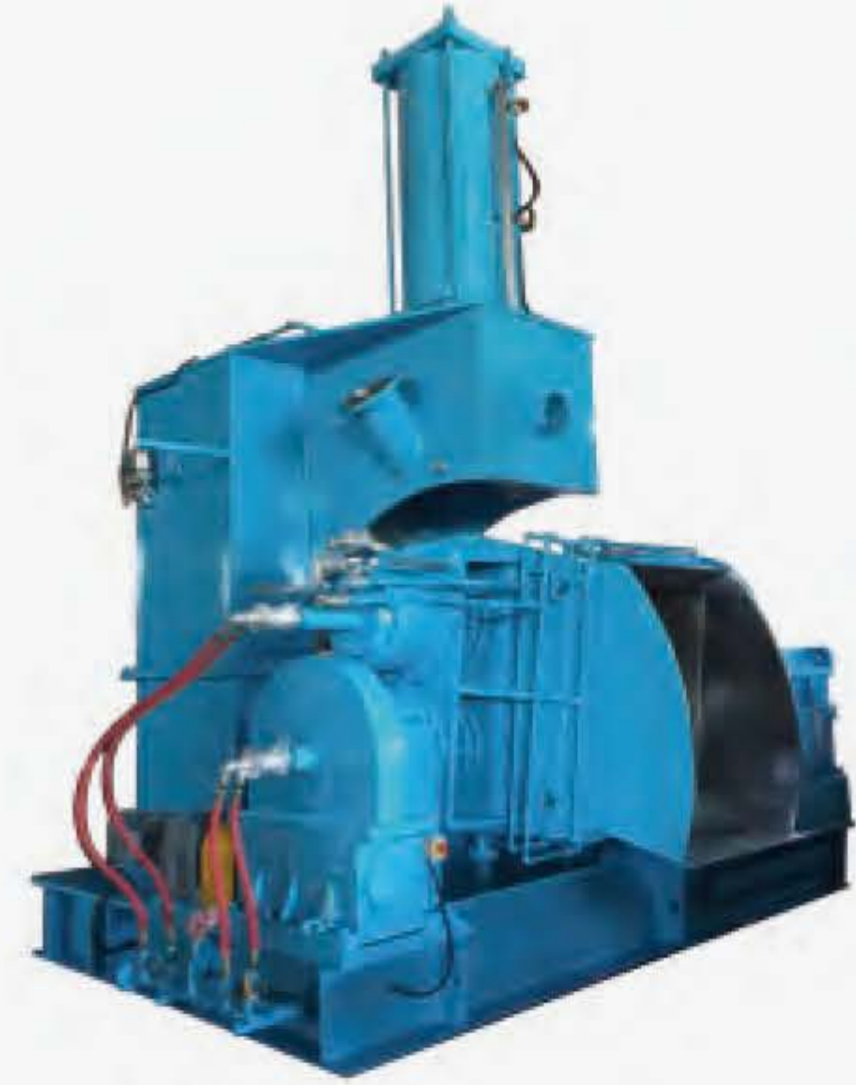
Air Ram Dispersion Kneader 空壓式密練機